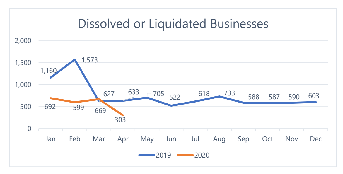
Figure 2 Dissolved or liquidated businesses (Leicester and Leicestershire)